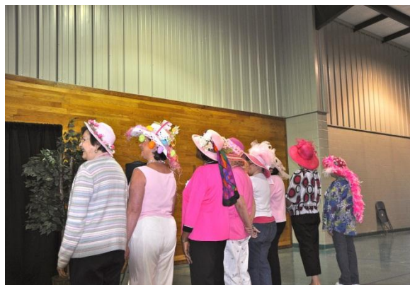
Best Pink Hat Contest