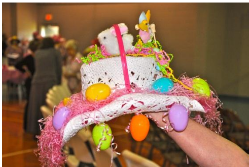
PINK HAT WINNER

At noon, it was time to find our seats, enjoy the sumptuous “Afternoon Tea” buffet and experience the program. We judged the marvelous pink hats, handed out door prizes, honored special guests and recognized those who had traveled far or were brand new.