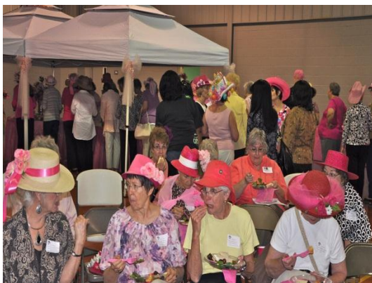
Enjoying the buffet