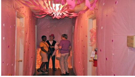
Pettus Home Hallway all Pinked UP!